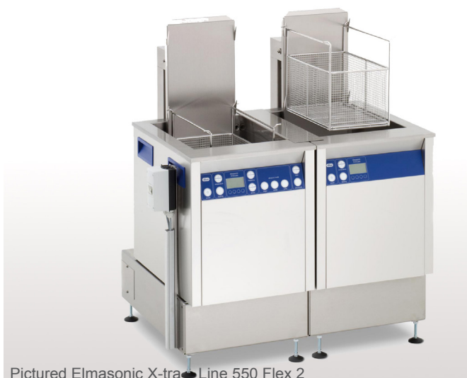
Pictured Elmasonic X-tra Line 550 Flex 2

Modular cleaning line consisting of ultrasonic cleaning unit plus rinsing unit, available in 5 different unit sizes (300, 550, 800, 1200 and 1600). There are two different models for each size: multi-frequency 25/45 kHz (MF2) or 37/130 kHz (MF3). Available rinsing tank models (S): with heating (H) or without heating. The oscillation device for the cleaning basket assists and improves the cleaning and rinsing effect and also provides a drip-off support for the stainless-steel basket (EKO). The cleaning line can be fitted with a hot air dryer (WLT) of the relevant size. The units are delivered including support frame.