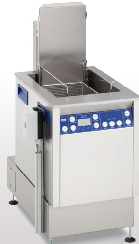
Pictured Elmasonic X-tra Line 550 Flex 1

Modular ultrasonic cleaning unit with oscillation device