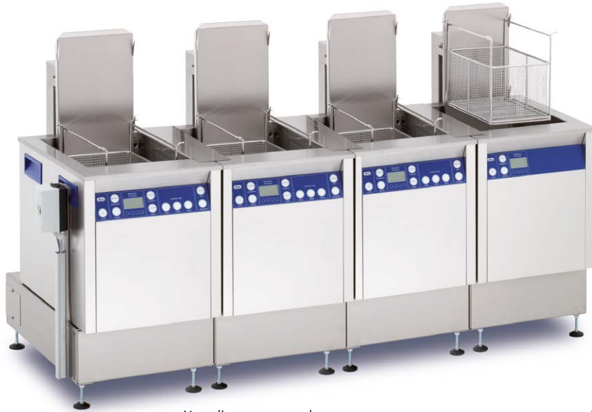
X-tra line pro manual with 3 ultrasonic units and 1 rinsing unit

Our modular concept consists of standardized components – from ultrasound equipment, transport systems and enclosures to ancillary devices. Thus these modular systems are easily and quickly upgradeable in response to changed cleaning requirements.