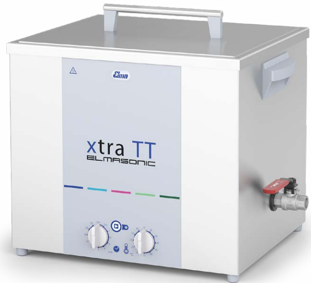
Elmasonic xtra TT 30H