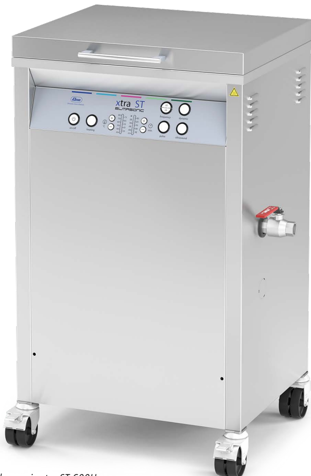
Elmasonic xtra ST 600H with hinged flip-top noise protection cover