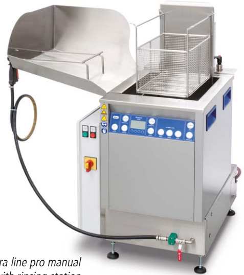
X-tra line pro manual with rinsing station